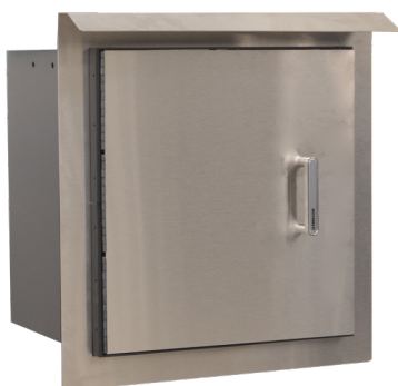
PRS-2 PACKAGE PASS-THRU UNIT

Hamilton's package pass-thru are designed to allow customers to securely pass items through a wall.