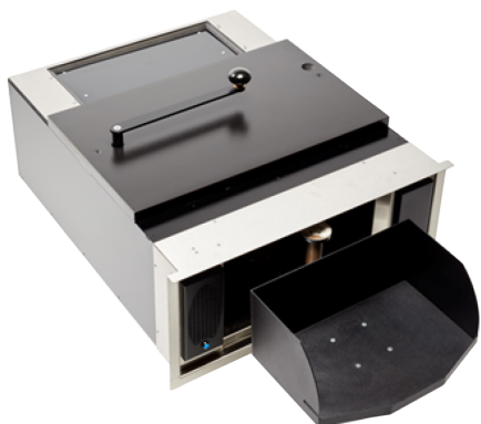
Bond Hill SLCD-MAN

The Bond Hill SLCD Manual drawer is designed to pass small items between the customer and your employee. Built with rugged, highperformance stainless steel exterior for maximum security. Perfect for prescription containers and other small items.